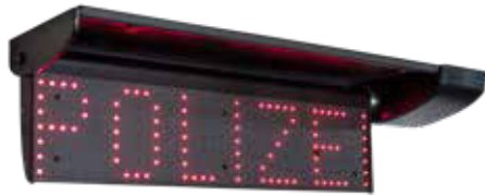
Takedown display and information display

Things have to go fast in an emergency - operation must be quick and easy while driving, especially in the case of civilian vehicles. We offer specially tailored products for undercover police operation.