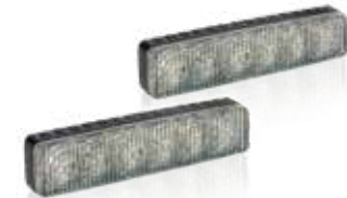
Sputnik SL Smoky