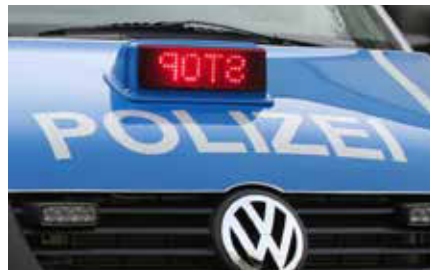
ASG engine bonnet