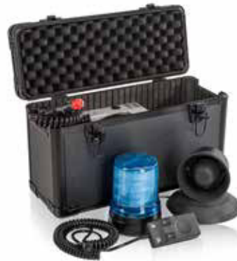
Mobile case system