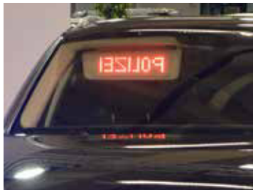
ASG sun visor