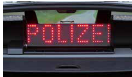
ASG/ISG hat shelf