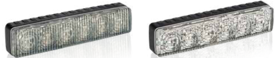
Comparison Sputnik SL Smoky – Sputnik SL